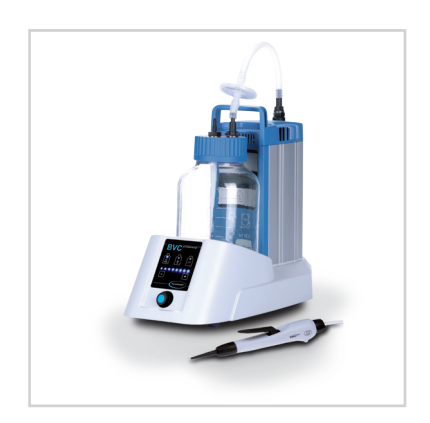
Version with glass bottle - for aggressive media, smaller quantities and quick autoclave