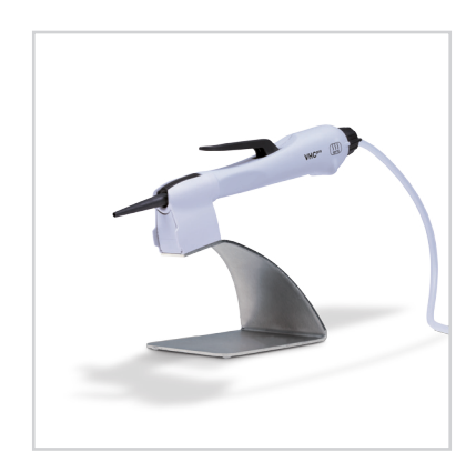
Complimentary range of accessories including table stand, tip ejector and BVC shuttle or adapter for eight pipette tips