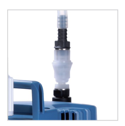
Quick-couplings PVDF - autoclavable, high chemical resistance (Standard only integrated with the BVC professional, available as an accessory for other variants)