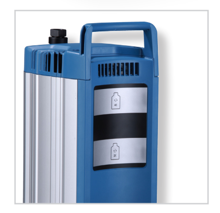
Non-contact liquid level sensor (only BVC professional)