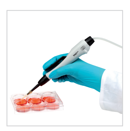
Patented, fully autoclavable, ergonomic hand set